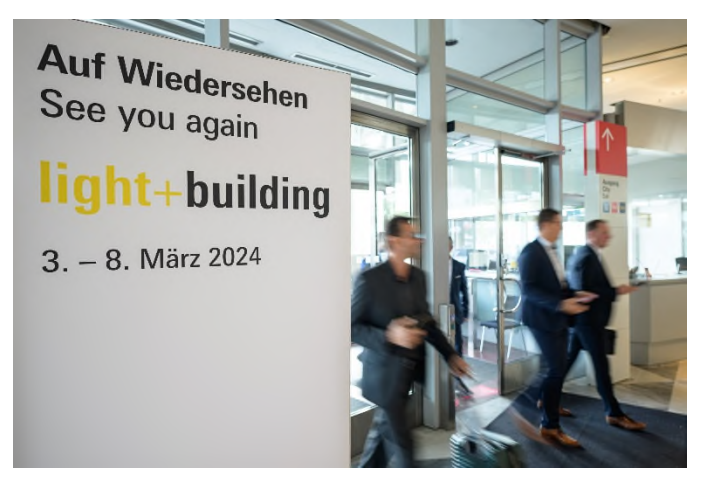
Satisfied visitors express their intention to return to Light + Building 2024.