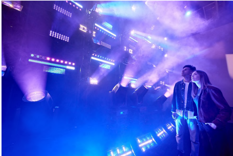
The world of event and entertainment technology as a live experience: Prolight + Sound 2025.

The 'MultiTech' subject area centred on flexible and smart solutions for various event formats – including multifunctional audio and lighting products, modular media pillars, and contributions to automated tracking and visualisation systems and to dynamic show control.