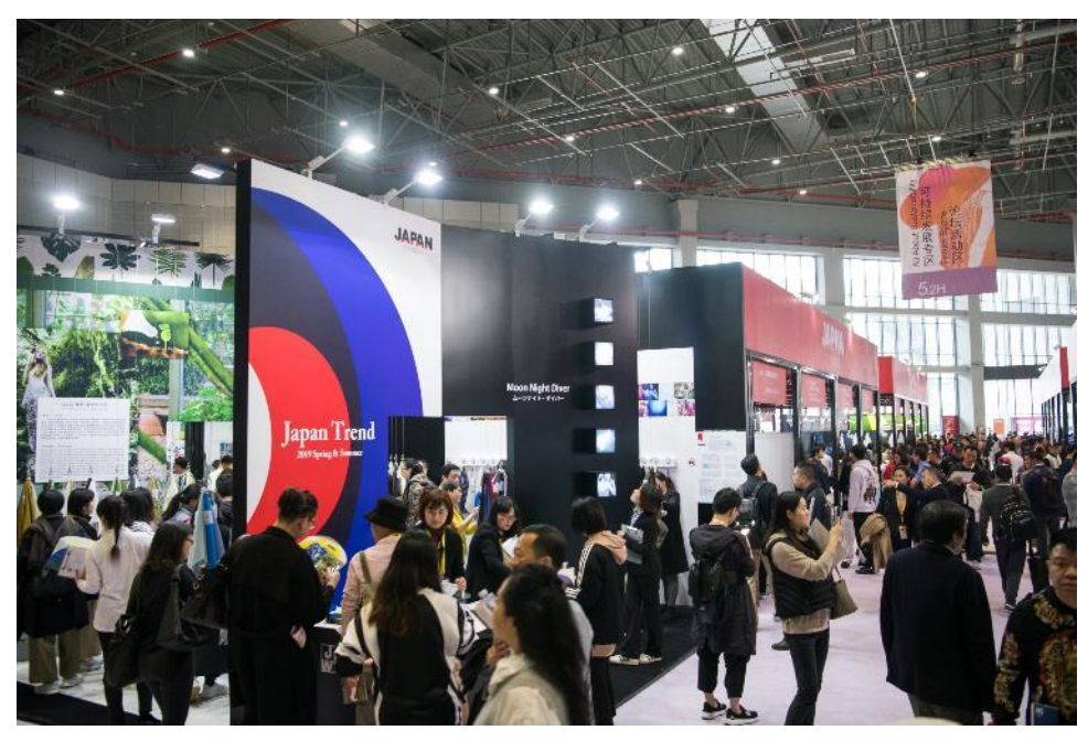
The Japan Pavilion's Trend Forum, a popular attraction at the 2018 Spring Edition