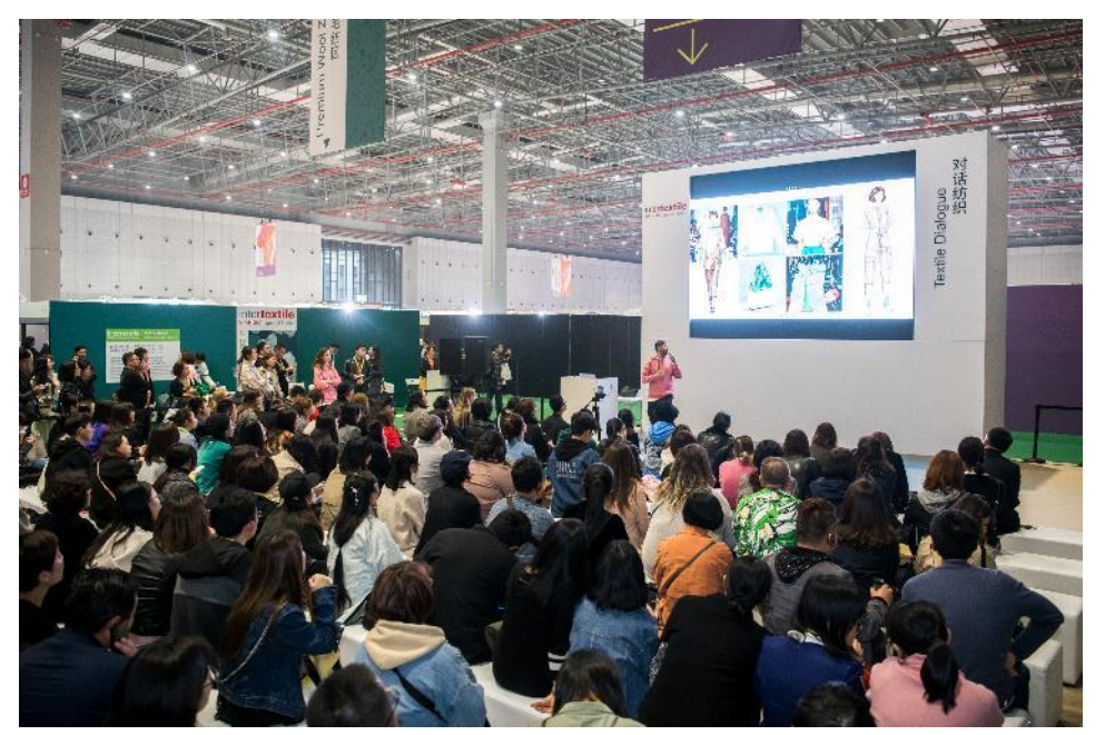
The 2018 Spring Edition's fringe programme drew large crowds

As a centre of debate for a wide variety of industry topics, other highlights will include close looks at functional innovations and Autumn / Winter 2019 – 20 fashion trends. Another highlighted topic to be debated in a panel discussion at the fair is the growing appeal of Africa as a production location, and in the future, a lucrative apparel market. Just a few decades ago, China was considered a similar low-cost production location, whereas now it is forecast to be the world's largest apparel and textile market in 2019. This growth makes Shanghai a fascinating place to join experts at the fair as they discuss Africa, predicted to be the next area of major expansion in the apparel market.