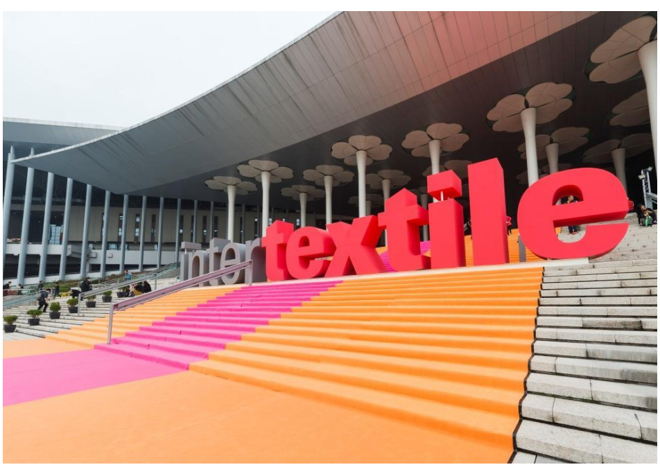
View from the South Square entrance at the NECC

Intertextile Shanghai Apparel Fabrics – Spring Edition opens next Tuesday at the National Exhibition and Convention Centre (Shanghai), running from 12 – 14 March. Around 3,300 exhibitors from 23 countries & regions will showcase their latest collections and services to trade visitors from around the world. New international exhibitors can be found throughout the country & region pavilions and zones, supporting Intertextile Apparel's status as a global apparel textile flagship.