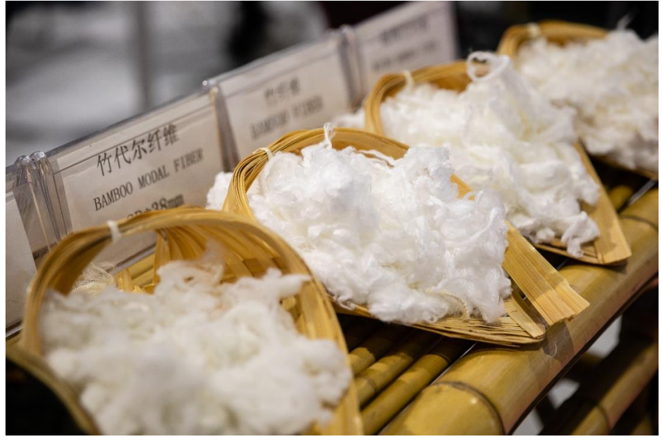
A diverse range of products and innovations can always be found at Yarn Expo

Yarn Expo Autumn 2019 opens next week, from 25 – 27 September, in hall 8.2 at the National Exhibition and Convention Center (Shanghai). Covering an area of 26,000 sqm, a record-breaking 542 suppliers from 14 countries and regions will join the show (2018: 501 exhibitors, 14 countries & regions), including new exhibitors from Lithuania, Nepal and Taiwan. The fair will offer yarn & fibre solutions for every sourcing need - with eco-friendly, functional and fashionable options to be found, and a new display area for fancy yarn.